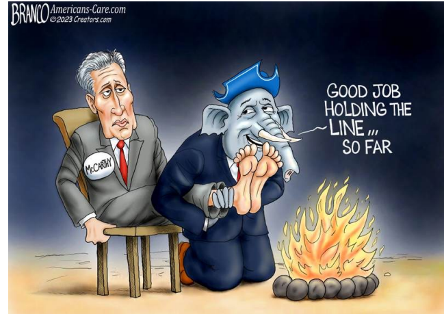
• May 24, 2023