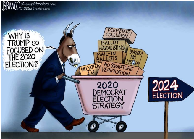
• May 22, 2023