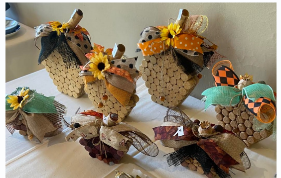
Pumpkins for sale