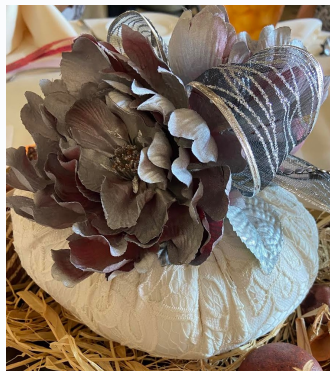
Once again lovely centerpieces