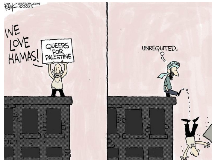
CHIP BOK • October 29, 2023