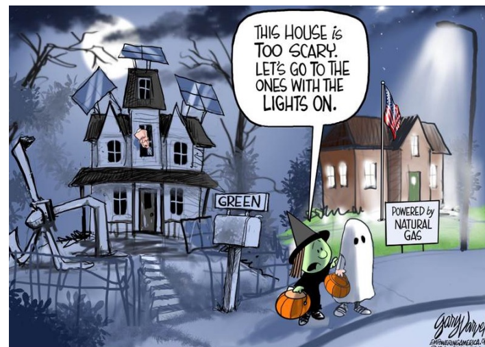
GARY VARVEL • October 26, 2023