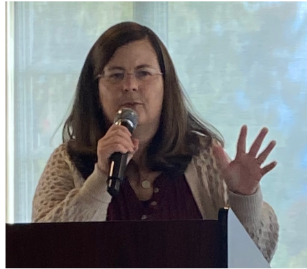
Patti brought petitions for for us to sign to reverse Prop 47