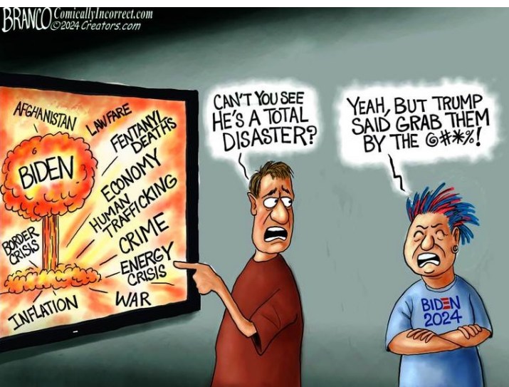
AF BRANCO • March 26, 2024