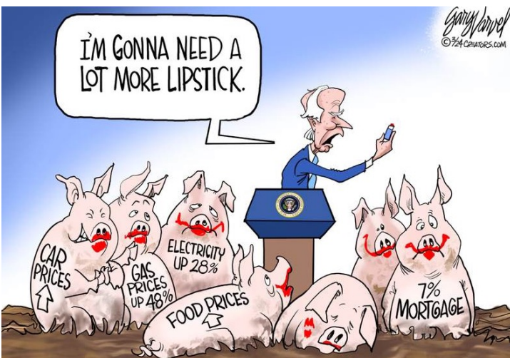
GARY VARVEL • March 22, 2024