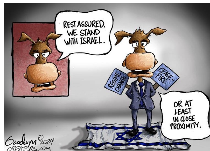
AL GOODWYN • March 26, 2024