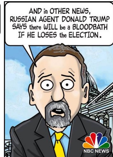
TOM STIGLICH • March 24, 2024