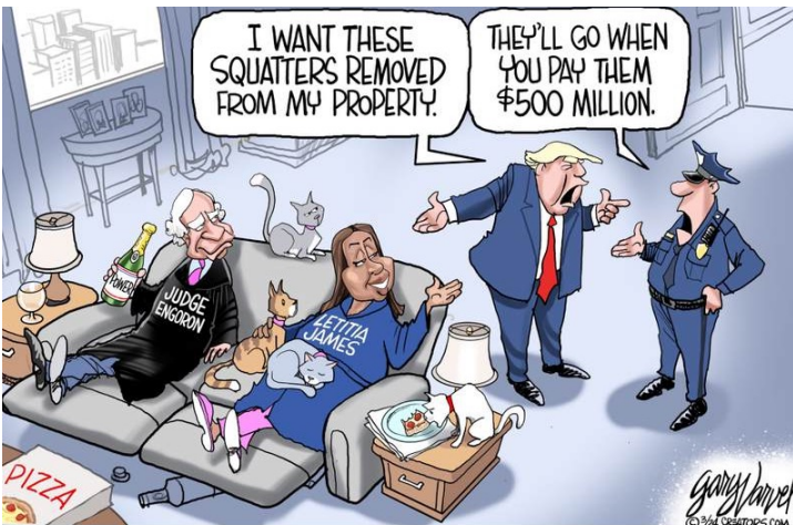
JUSTICE in BIDEN'S AMERICA