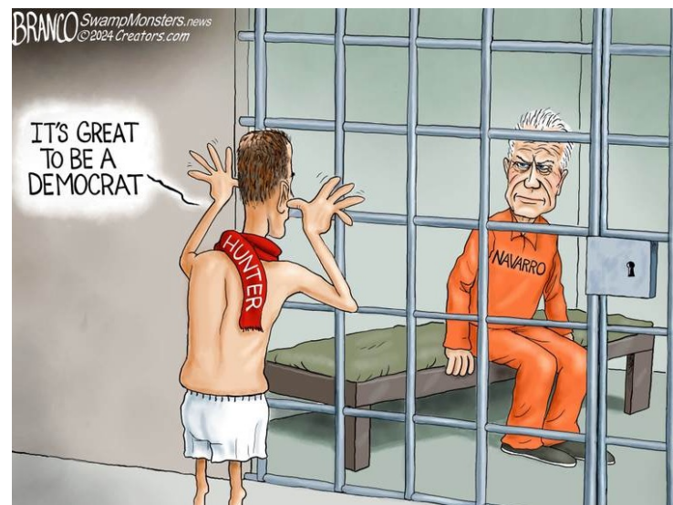
AF BRANCO • March 25, 2024