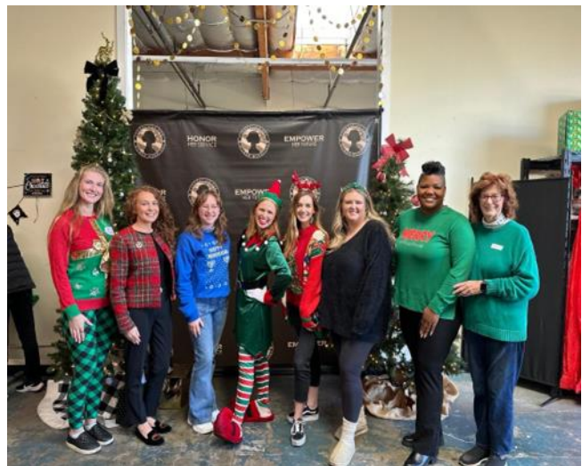
Santa's Elves handing out TOYS