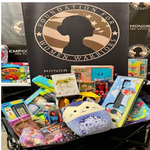
Ho Ho Ho TOYS

THANK YOU, Republican women. Your generous support helped make a happy Christmas for many military families. At our November 15 th meeting we collected about 70 toys and games. We collected 30 more toys in the weeks following our meeting. These were delivered to the warehouse in Vista, operated by the Foundation for Women Warriors. Some of the additional gifts were: a 21" guitar, Water blaster, Monster Jam trucks, Push and Play alligator, Crystal growing kit, T.Rex Fossil building kit, Caterpillar tractor, Spiderman action figures, Barbie dolls, a Slide and Play Piano phone, Flash Superfriend, Mini Monster Jam trucks, Royal Diana doll, a fishing game, Cobra Loop track set. Table top Target Trivia set, Jewelry Designer case and beads, 100 Games Boredom Buster Box, SpongeBob SquarePants Desktop Pinball. We also had cash donations of $150.00 and some girl's clothing.