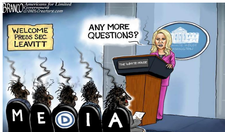
• Jan 29, 2025