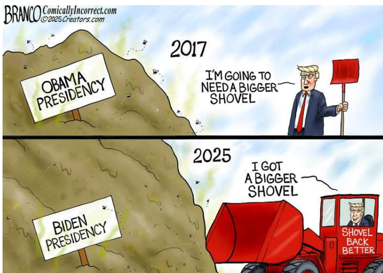
• Jan 22, 2025