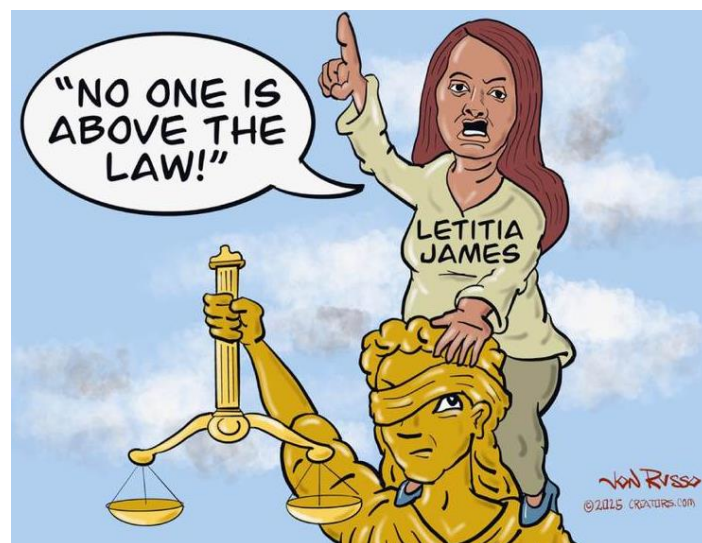
JON RUSSO • Apr 22, 2025