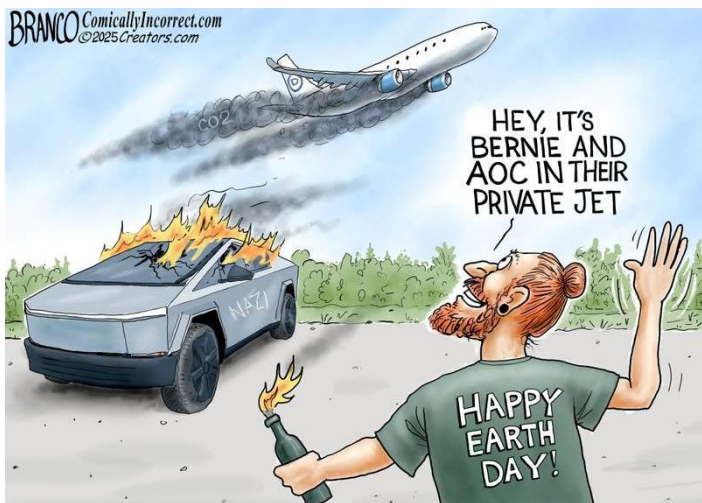
AF BRANCO • Apr 24, 2025