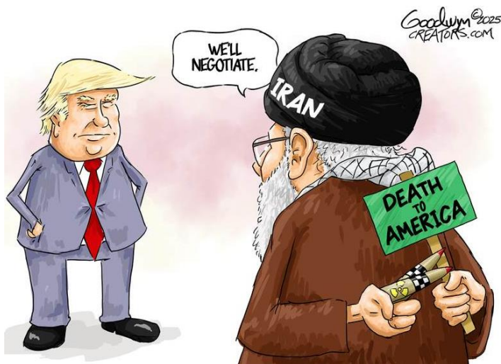
AL GOODWYN • Apr 24, 2025