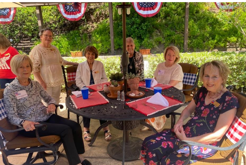
A fun time was had by all at the NEW MEMBER SOIREE