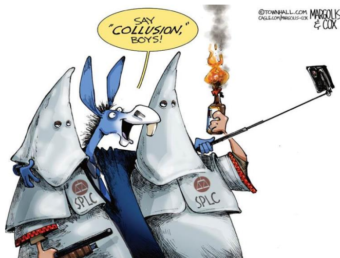
MARGOLIS & COX • Apr 27, 2026