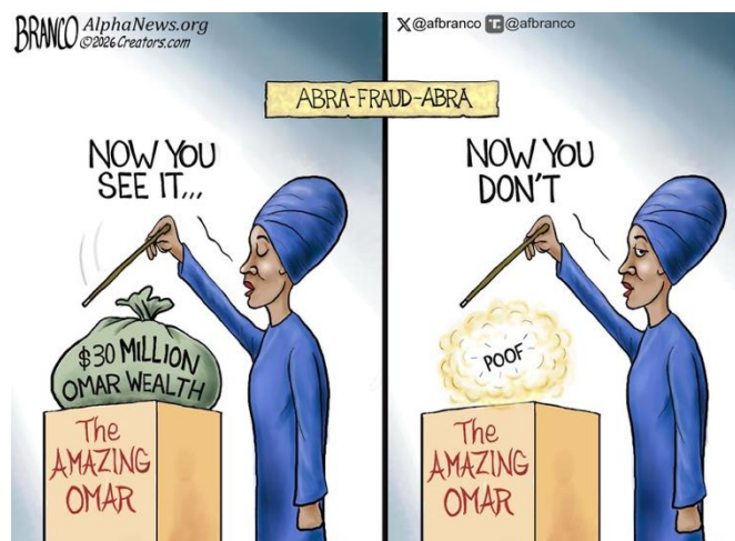
AF BRANCO • Apr 26, 2026